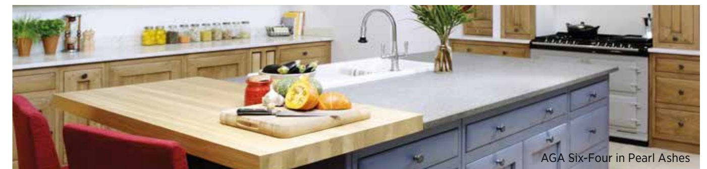
AGA Six-Four in Pearl Ashes

Distinctive and attractive, the Six-Four cooker hood is the ultimate complement to the Six-Four cooker. The three speed fan seamlessly combines both efficiency and styling.