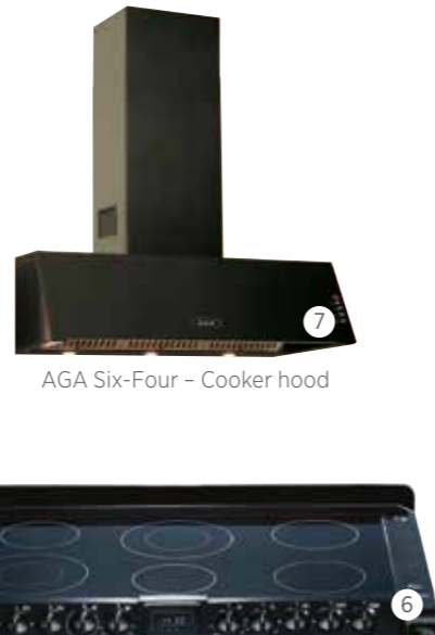
AGA Six-Four – Cooker hood

Distinctive and attractive, the Six-Four cooker hood is the ultimate complement to the Six-Four cooker. The three speed fan seamlessly combines both efficiency and styling.