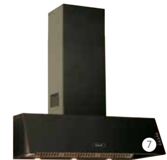
AGA Six-Four – Cooker hood