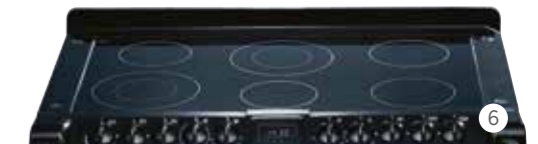
AGA Six-Four – Ceramic hob