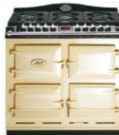
AGA Six-Four Classic Special Edition*