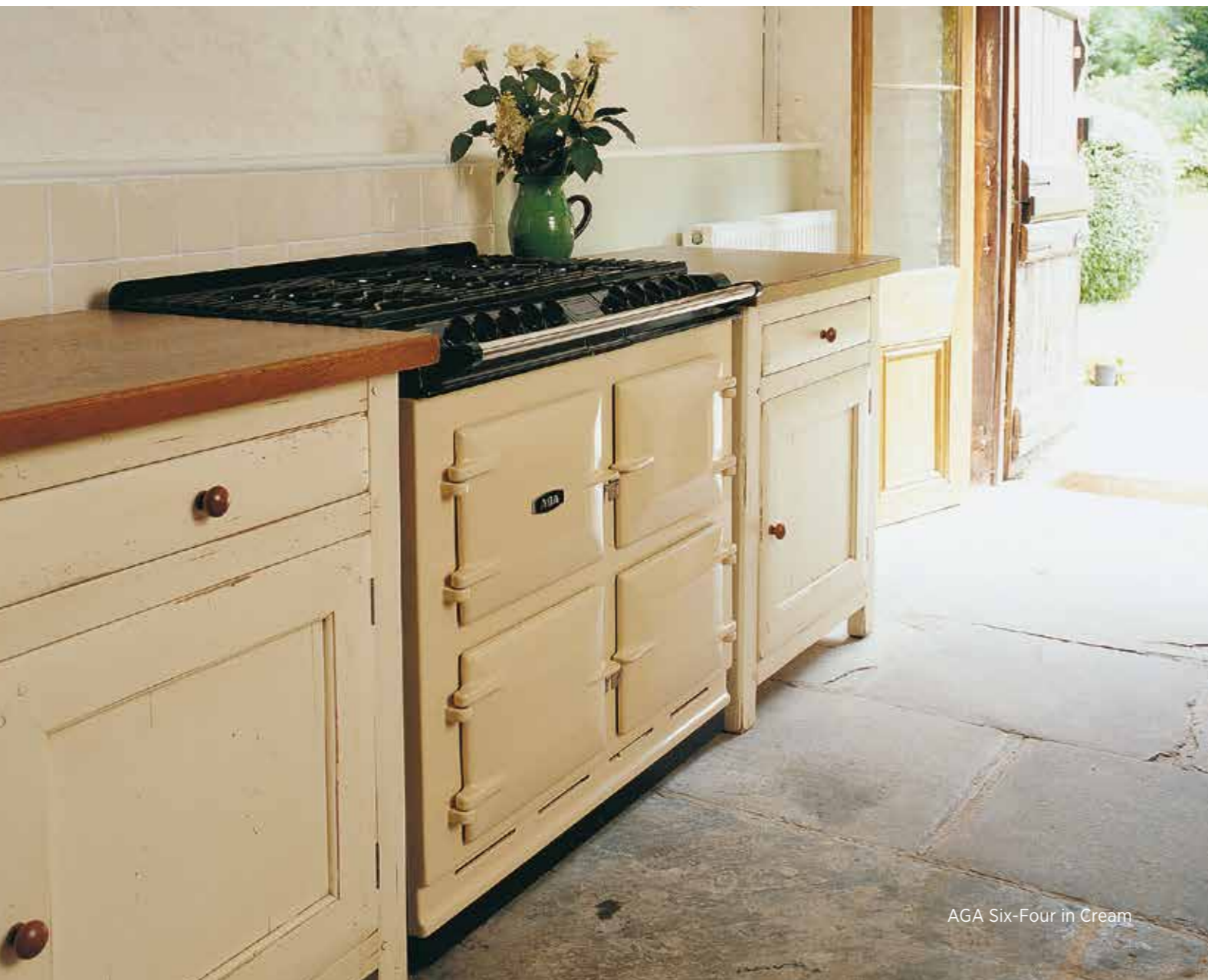
AGA Six-Four in Cream