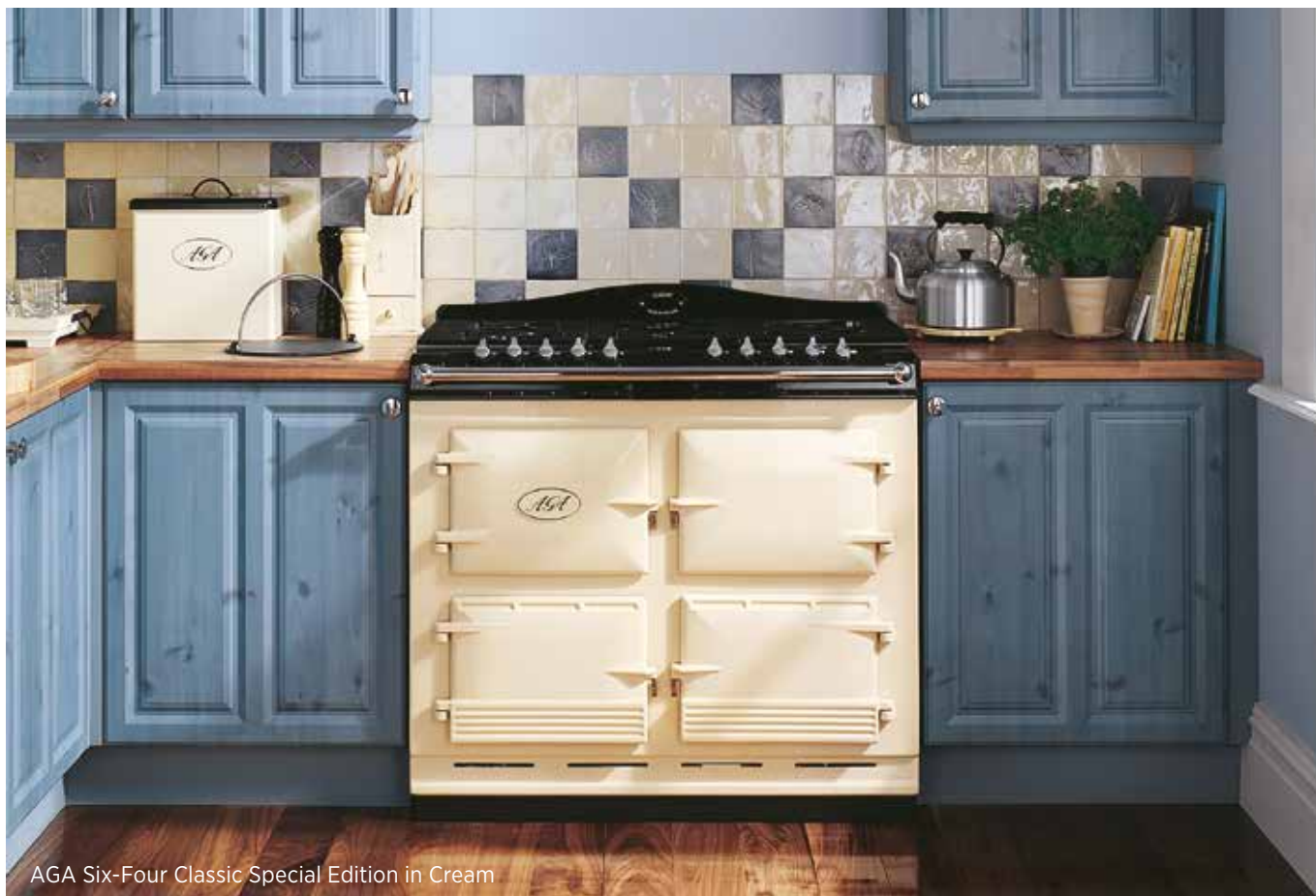
AGA Six-Four Classic Special Edition in Cream